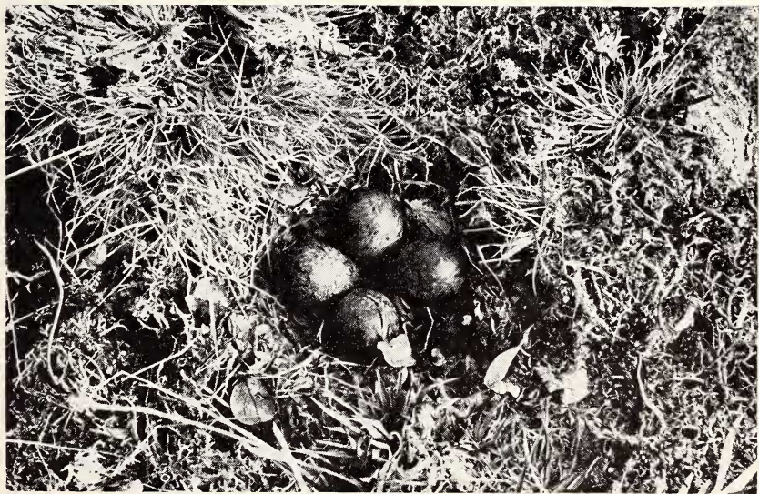
Fig. 5. Nests of Western Sandpipers, a) in wet tundra, 22 June (some blades are bent to the side to look into the nest), b) in dry to mesic tundra, open nest, 27 June 1960.